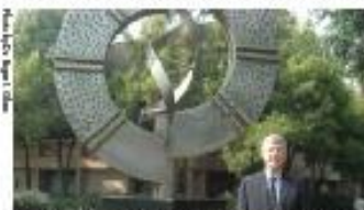
NIH Director Dr. Francis S. Collins recently spent a week touring India's top research sites, including a center in Bangalore, where he posed with a statue dedicated to India's genome.

NIH Director Dr. Francis S. Collins made his first official visit to India recently, touring the country's top research sites, reviewing existing collaborations and discussing potential new areas for partnership. India is scaling up its investment in research and training, providing additional opportunities for collaboration. Collins met with leading scientists and students at NIH-funded institutions, gave several public lectures and participated in a summit on low-cost medical technologies. A joint U.S.-India effort is being explored to spur development of affordable diagnostic and intervention tools intended to drive down health care costs in both countries. Collins also signed agreements to collaborate on stem cell research and diabetes.