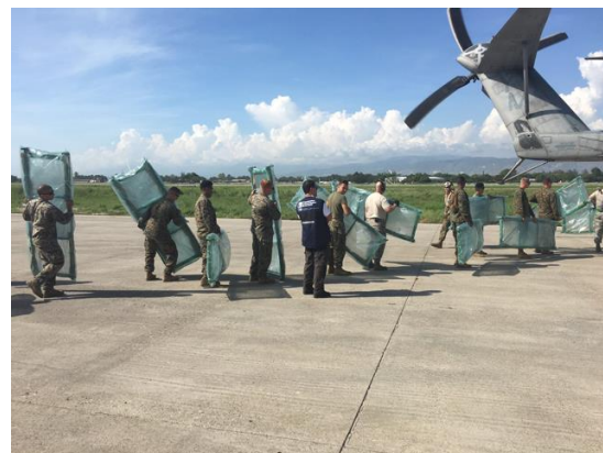
PAHO/WHO and Military delivering cholera beds to Haiti