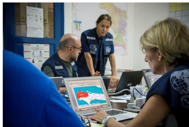
PAHO-Haiti coordinating response operations