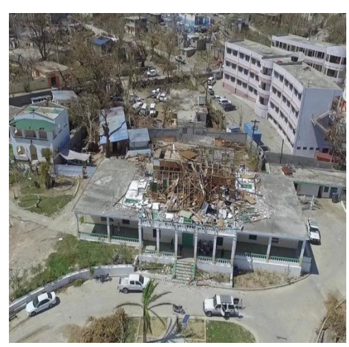
Saint Antoine Hospital (Grand' Anse, Haiti), severely damaged.