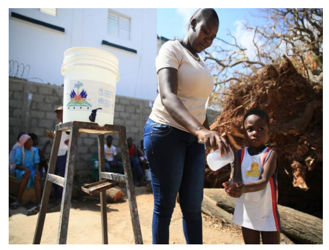
Hygiene measures taking place in the Haiti population