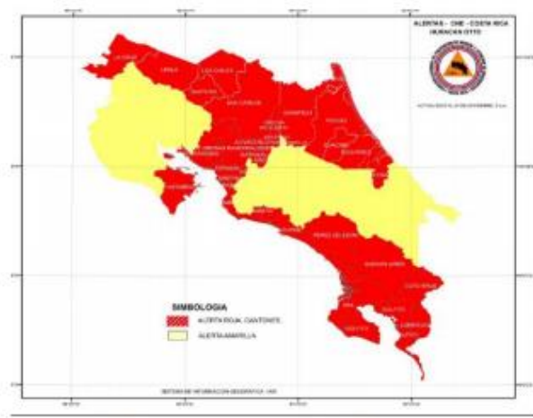
Red and yellow alert areas in Costa Rica