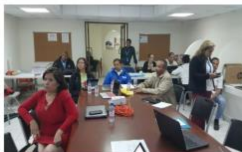
Pictures: Panama Ministry of Health EOC (Minister, Viceminister, technical and management team, Social Security with PAHO/WHO support)