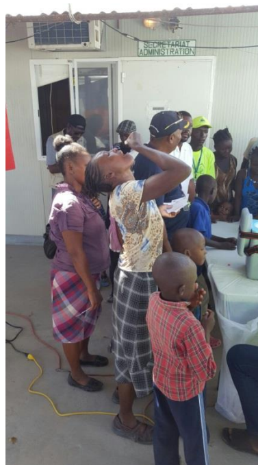
Cholera vaccination campaign underway in Haiti.