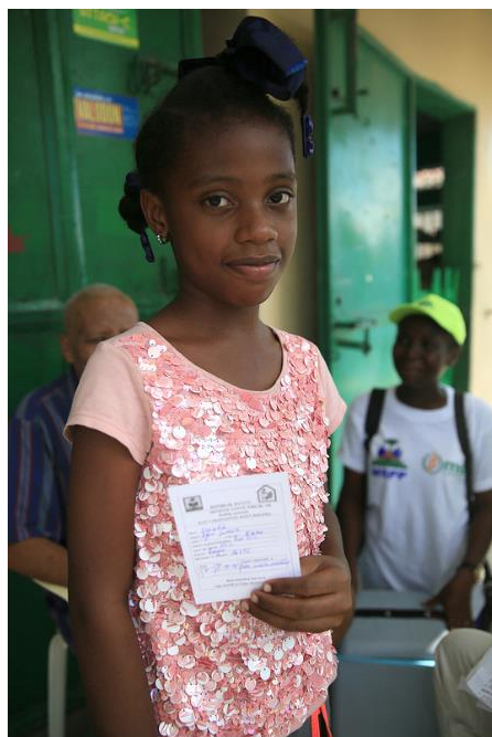
Cholera vaccinations in the city of Les Cayes, Sud Department, Haiti.