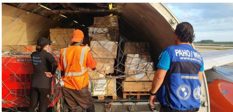
Figure 1: Logistics Support System (LSS) has been set up by PAHO