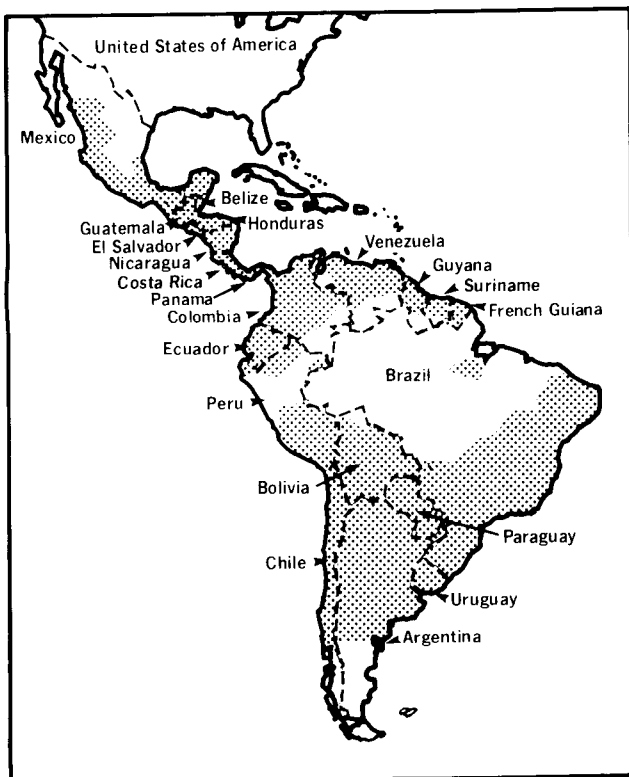
Figure 1. Distribution of Chagas' disease in the Region of the Americas.

The endemic area covers some 80% of the country's territory, which amounts to 1,099,581 km 2 . Infected vectors have been found in seven of the nine departments into which Bolivia is divided. Based on data obtained by means of serology in different population groups, it is estimated that in the Cochabamba, Sucre, Tarija, and Santa Cruz areas, there could be more than 500,000 infected persons.