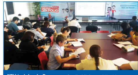
fIPV training in Paraguay.

With the premise that "no country is exempt from the entry of diseases imported from other latitudes, but we can prevent their spread in our territory," the strategic axes served were: high and homogeneous vaccination coverage, high