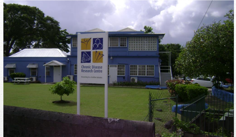
Chronic Disease Research Unit