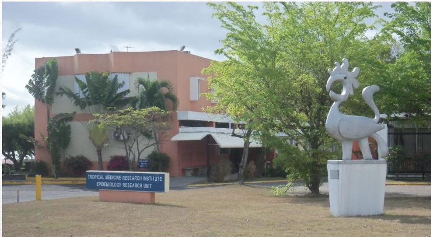
Sickle Cell & Epidemiology Research Units