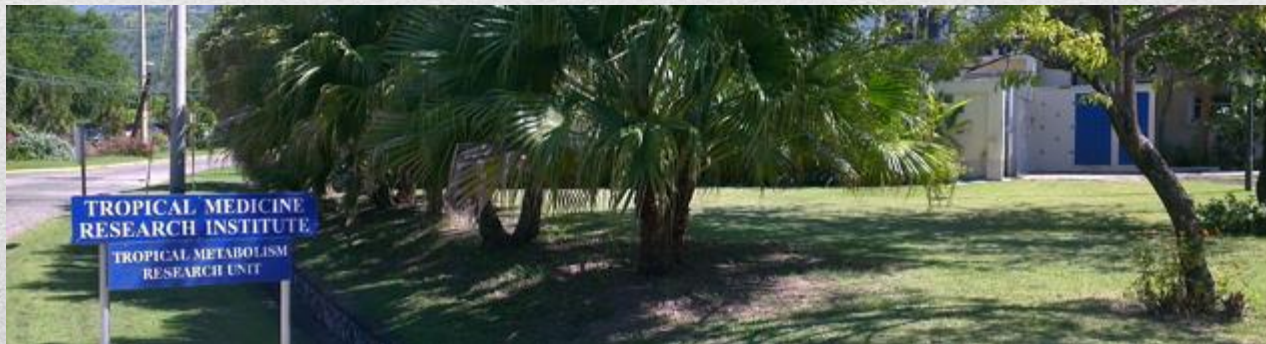
Tropical Metabolism Research Unit