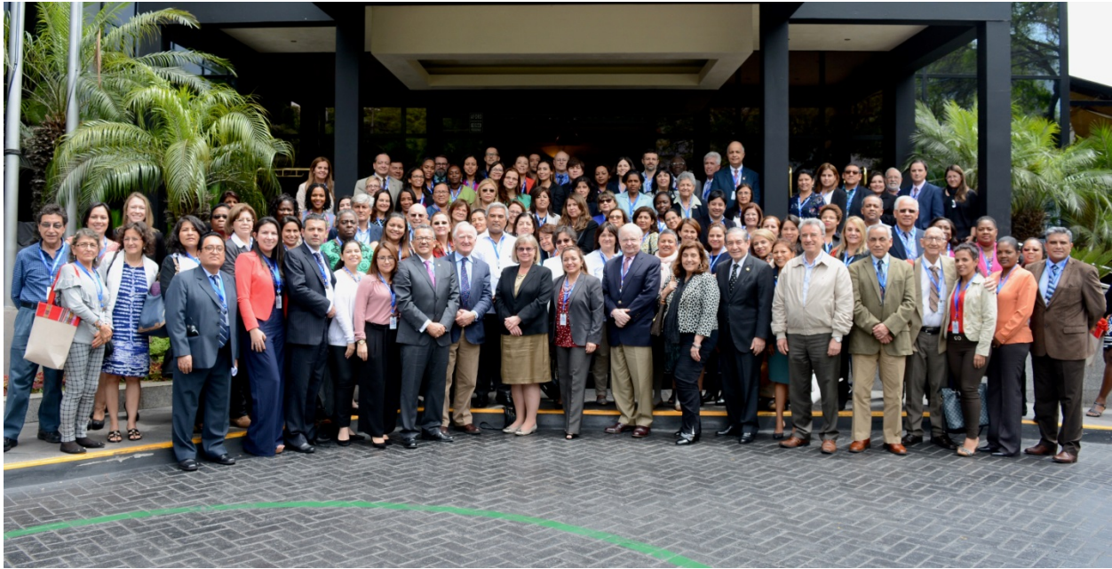
Participants at fifth regional polio meeting in Lima, Peru, December 2017