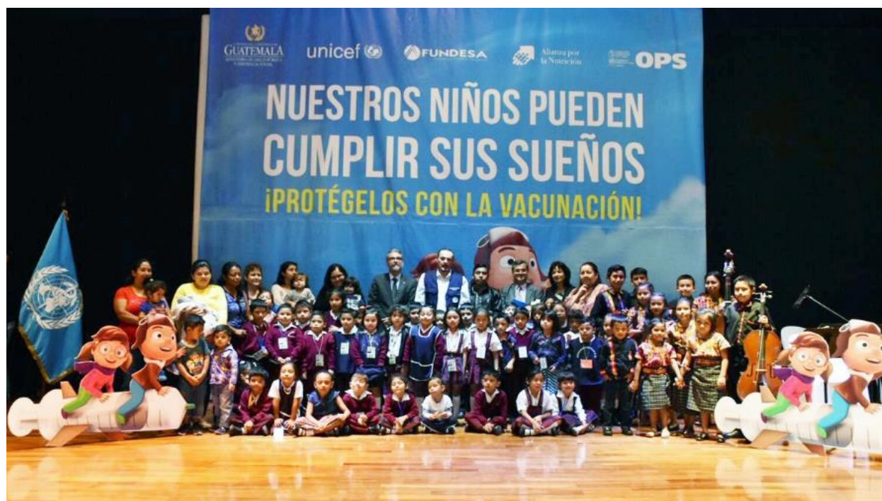
The Ministry of Health launched the vaccination campaign with PAHO/WHO and UNICEF representatives, children and their parents.

Children dream big. They dream of becoming a musician, a doctor, a teacher or an airplane pilot. If children are healthy, they can make their dreams come true. This is the statement of the nationwide MMR/OPV vaccination campaign that the Ministry of Health, along with PAHO/WHO, the Foundation for the Development of Guatemala (FUNDESA), the Nutrition Alliance and UNICEF launched in Guatemala.