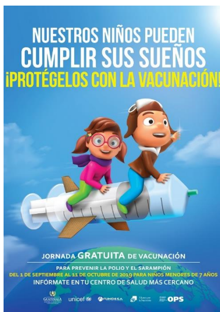
Advertising sample of the Guatemala vaccination campaign that aims to reach more than two million children under 7 years old.