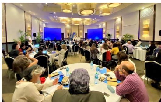
Fourth Regional Meeting on the Quality and Use of Vaccination and Surveillance Data.

During the second part of the meeting, an update on the progress with surveillance in the Global Information Systems WIISE project was given. Additionally, the status of the VPD Regional Surveillance Information System was explained to inform participants of future plans. By working in groups, it was possible to identify challenges presented by information systems in the epidemiological surveillance of countries and how they affect the data quality.