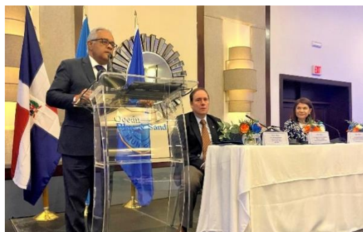
Ministry of Health at launch of the Fourth Regional Meeting on the Quality and Use of Vaccination and Surveillance Data in Punta Cana, Dominican Republic, February 2020.

The first half of the meeting focused on immunization data quality and use. Countries and partners presented their experiences overcoming challenges with recording and reporting high quality data and discussed potential interventions to improve quality issues. Next, the focus turned to using immunization data at all levels for decision-making and the importance of using data to strengthen immunization programs. Participants worked together to establish strategies for improving the use of vaccination data to address relevant challenges.