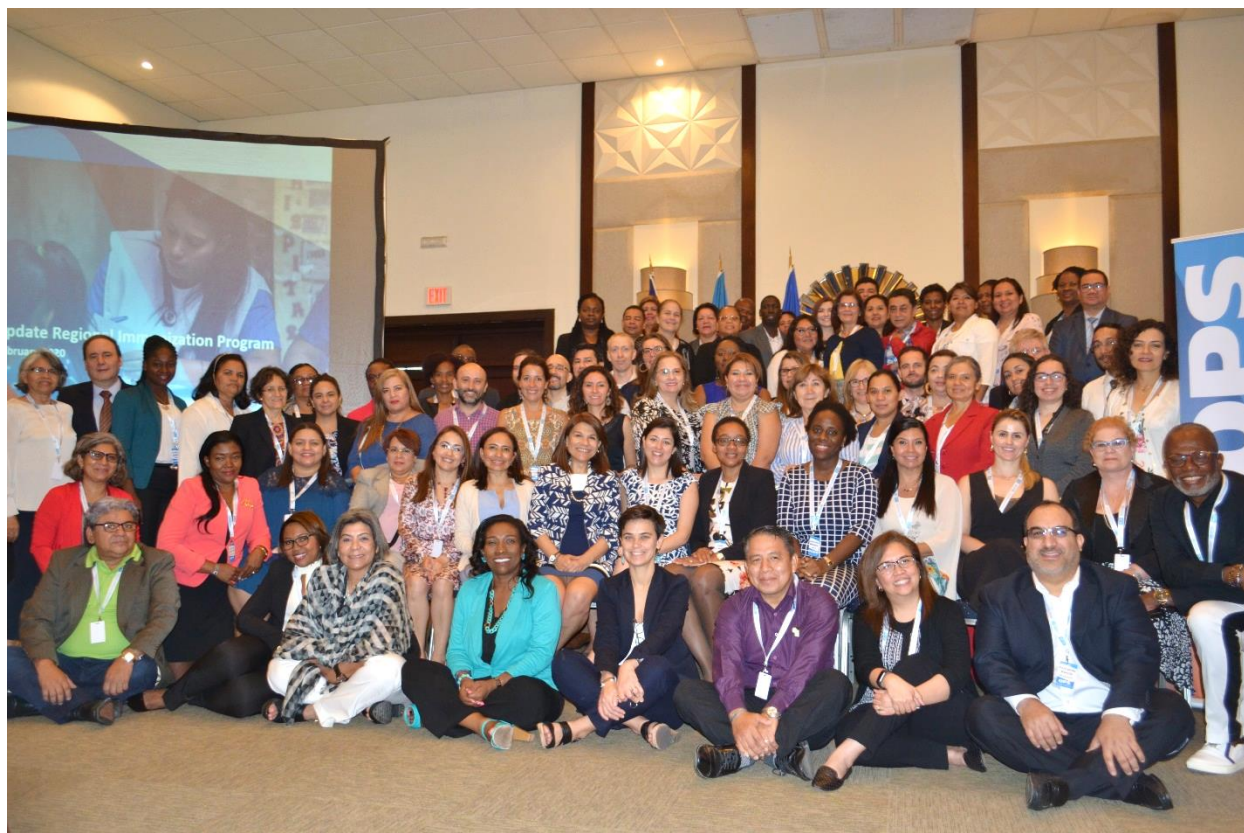
Fourth Regional Meeting on the Quality and Use of Vaccination and Surveillance Data held in Punta Cana, Dominican Republic, February 2020.