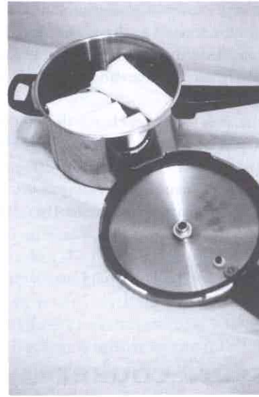
Perforate the bottom of a tin can with holes, place it in pressure cooker, and fill only 75% of the space available above the rack.

6 cms, that has been perforated on the top with nail holes about 0.5 cms in diameter. The support should be made of a material that will not retain water. Wood, for example, is unacceptable.