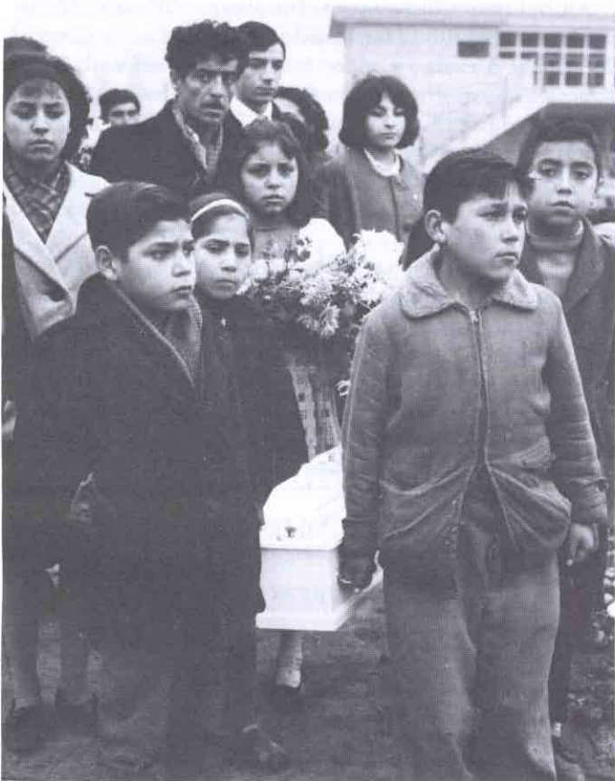
The death of a child is an everyday occurrence in many parts of the world; however, the mortality rate of children would be lowered if all children had access to the routine vaccinations that are already commonplace in the developed world.

temperatures and protect vaccines have also been improved. Coupled with this technical progress is an economic advantage—the cost of measles vaccine has declined to only 10 cents per dose.