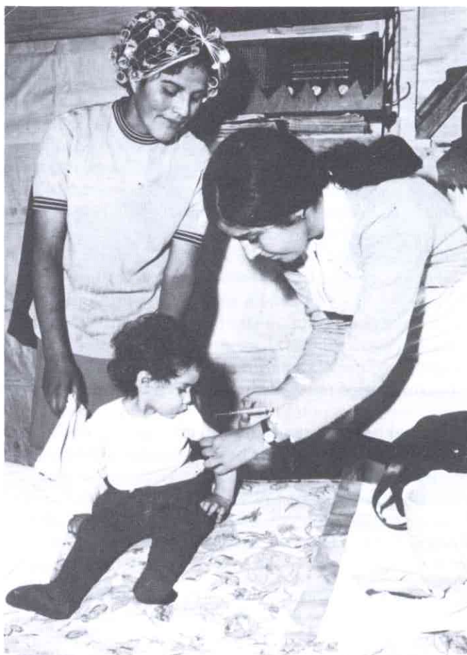
Public health care efforts should increase in times of economic hardship as health care needs increase with recession. One particularly important preventive measure is immunization.